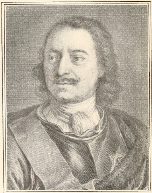
PETER THE GREAT